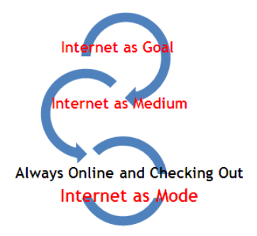
Figure 2. Normative digital pathways leading to the adolescent mode of Always Online and Checking Out